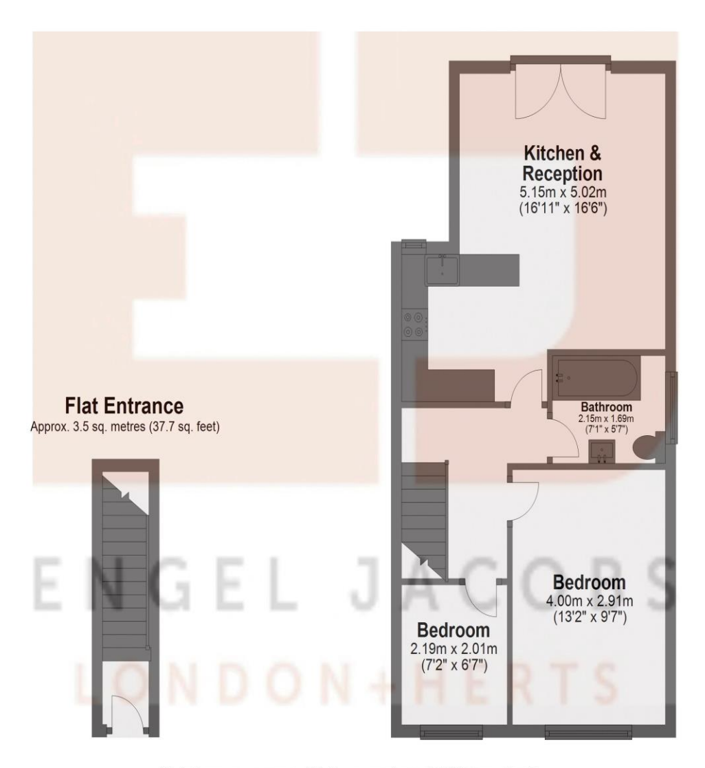
First Floor Approx. 48.2 sq. metres (519.0 sq. feet)

Total area: approx. 51.7 sq. metres (556.7 sq. feet)